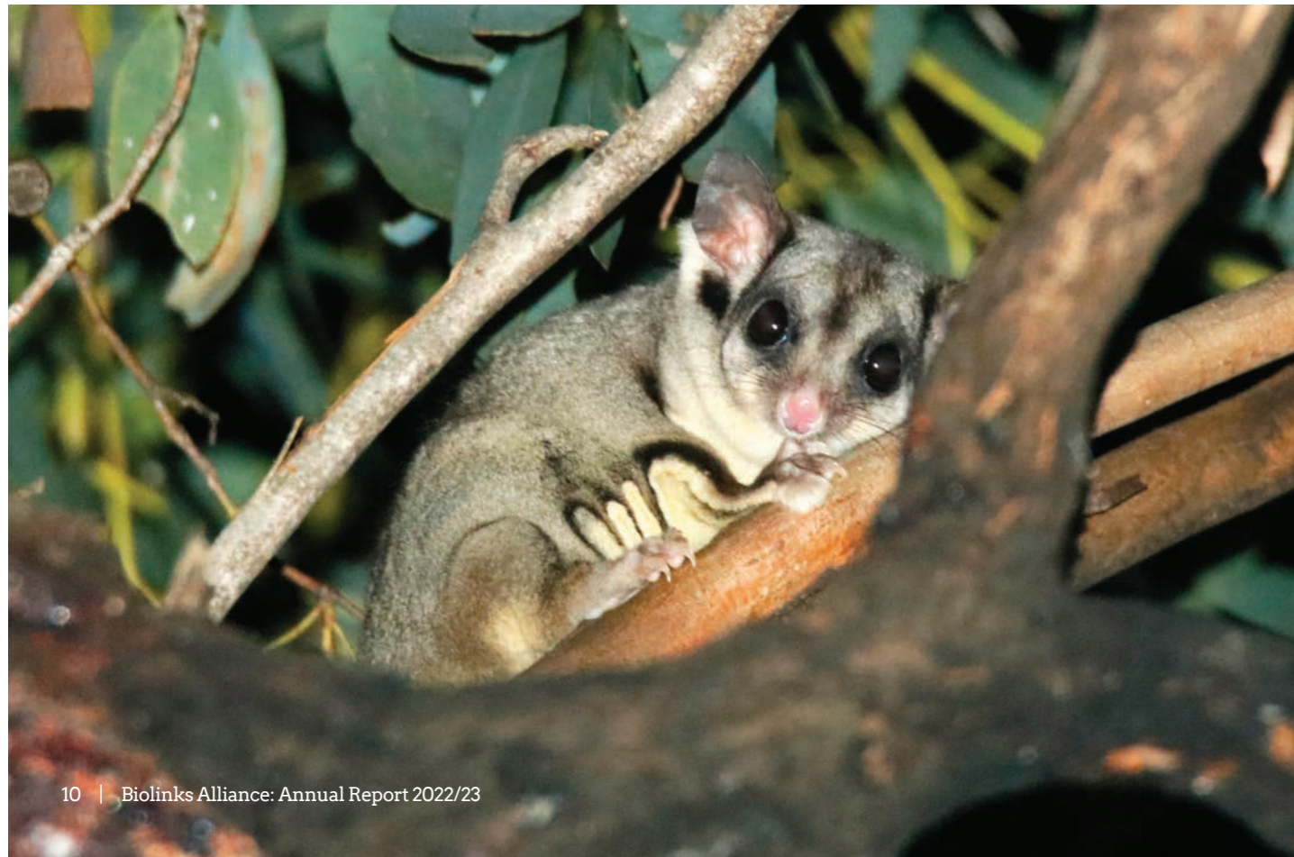
An endangered Squirrel Glider recorded on a property in Seymour, on Taungurung country.

This is a collaborative, multi-stage project currently spearheaded by Seymour Urban Landcare and the Hughes Creek Catchment Collaborative in partnership with Biolinks Alliance and BEAM Mitchell Environment Group. It builds on work carried out by Strathbogrie Ranges Conservation and Whiteheads Creek Landcare Group.