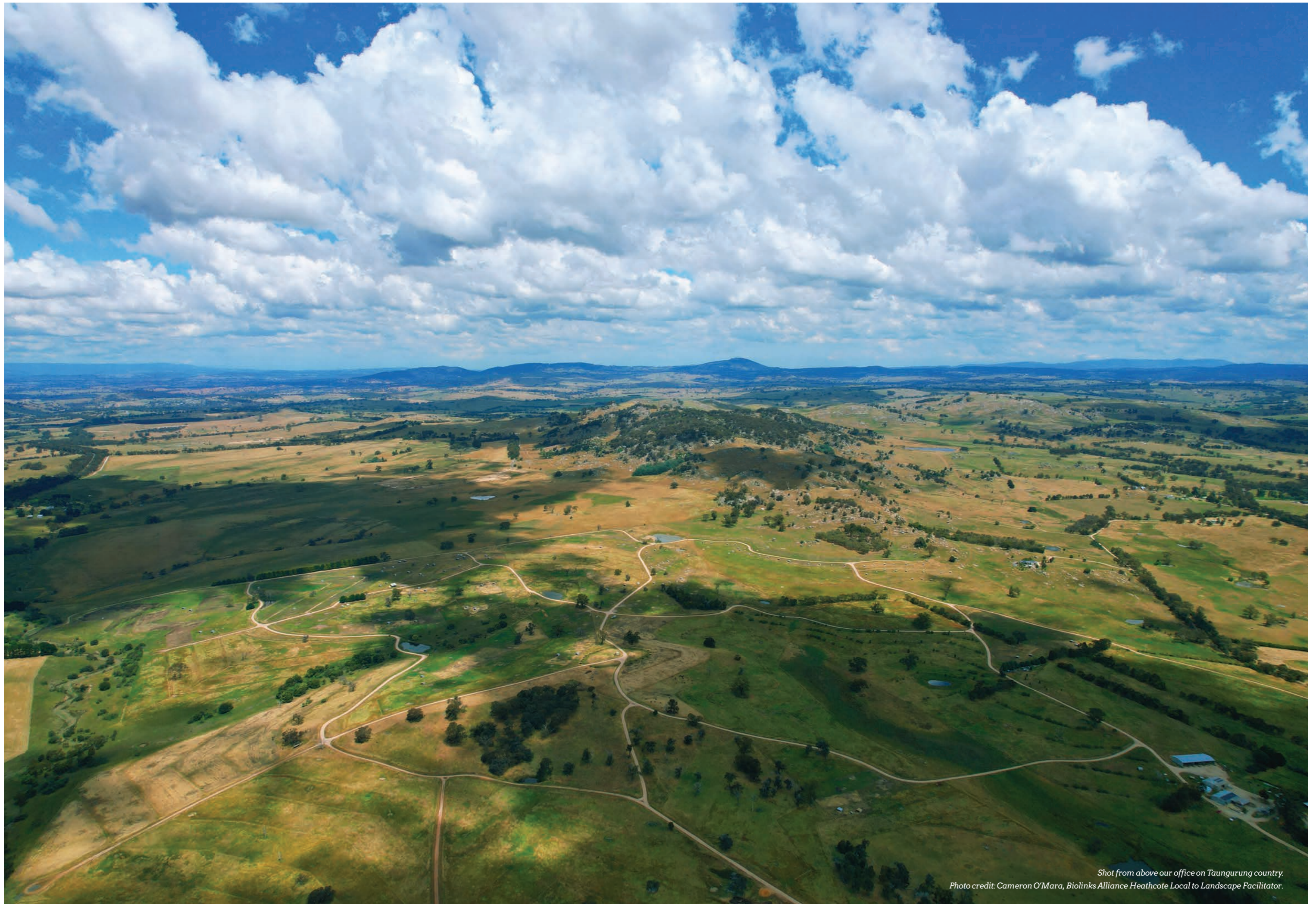
Shot from above our office on Taungurung country.