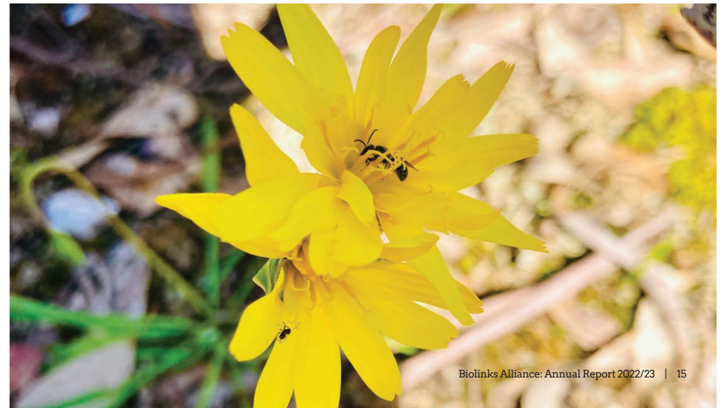
Yam Daisy