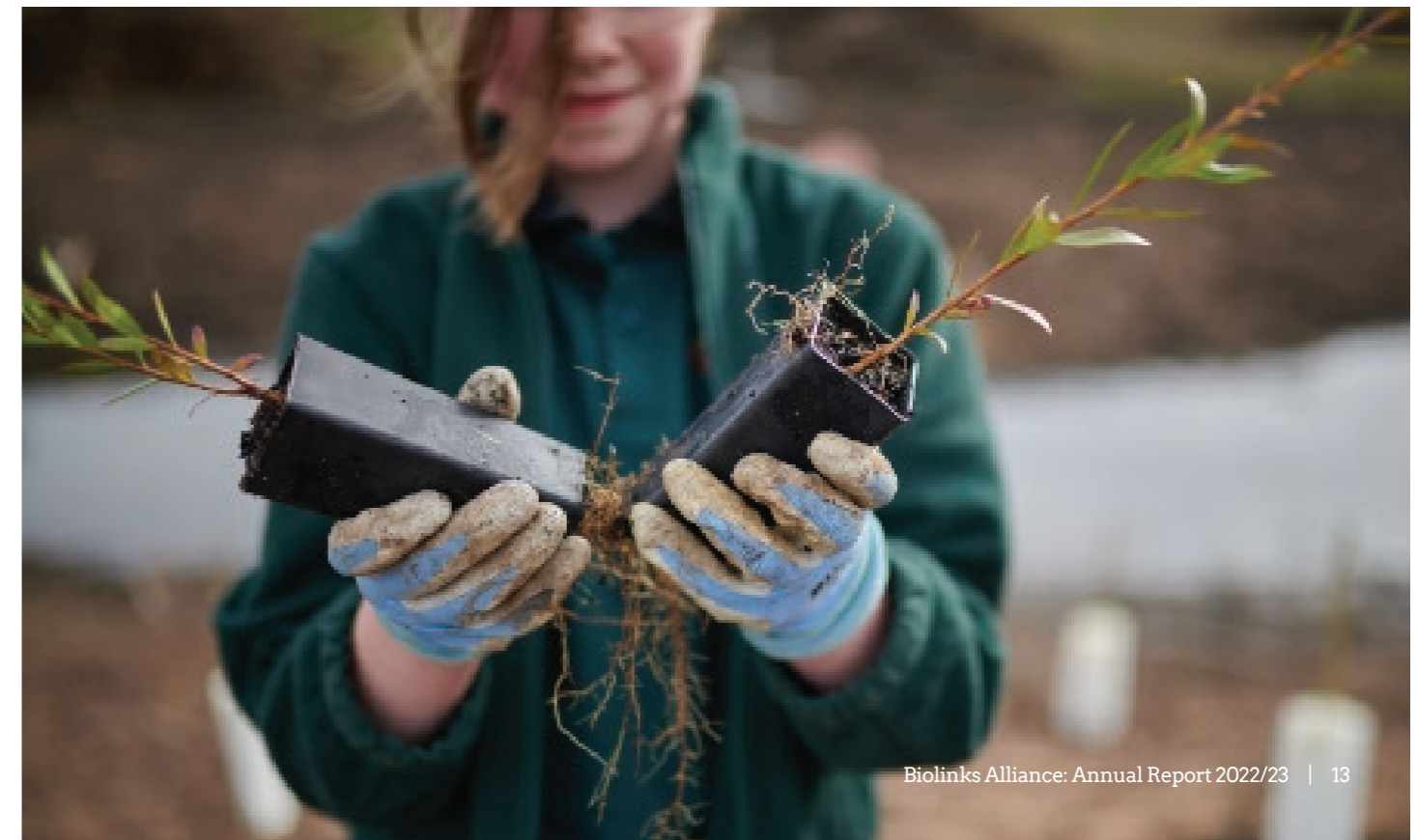
A Kyneton Primary School student at a riparian planting day at Snipes Creek, on Dja Dja Wurrung and Taungurung country.