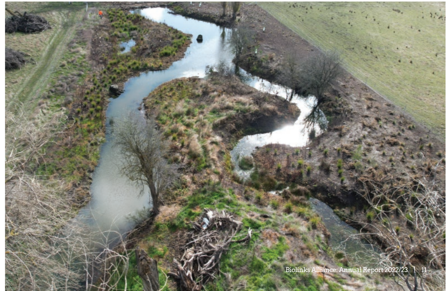
Snipes Creek Repair Pilot Project on Dja Dja Wurrung and Taungurung country.